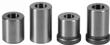
Fase oder Zentrieransatz chamfer or centering neck